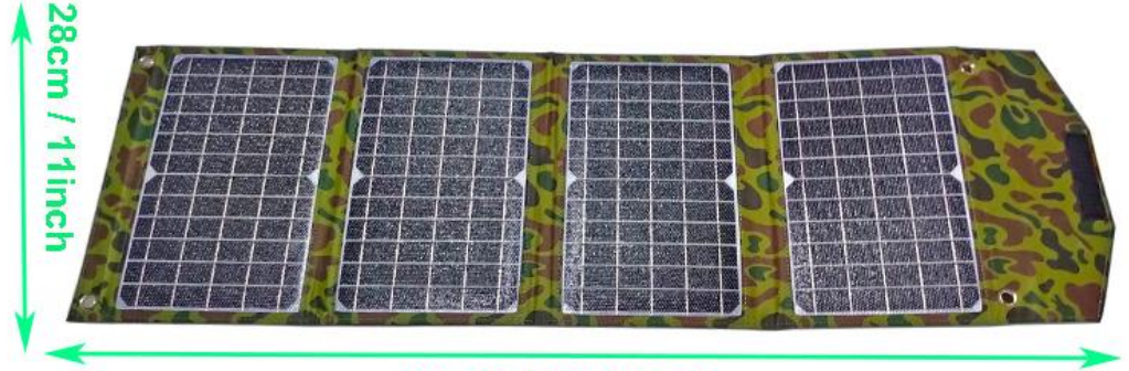
90cm / 35.4 inch