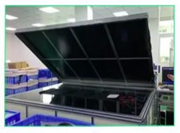
EL testing for foldable solar panel