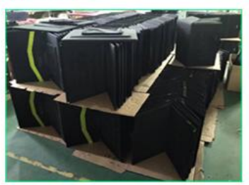
Finished products waiting for clean